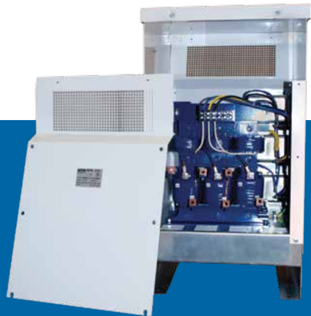
Matrix AP: NEMA 1 Shown Above